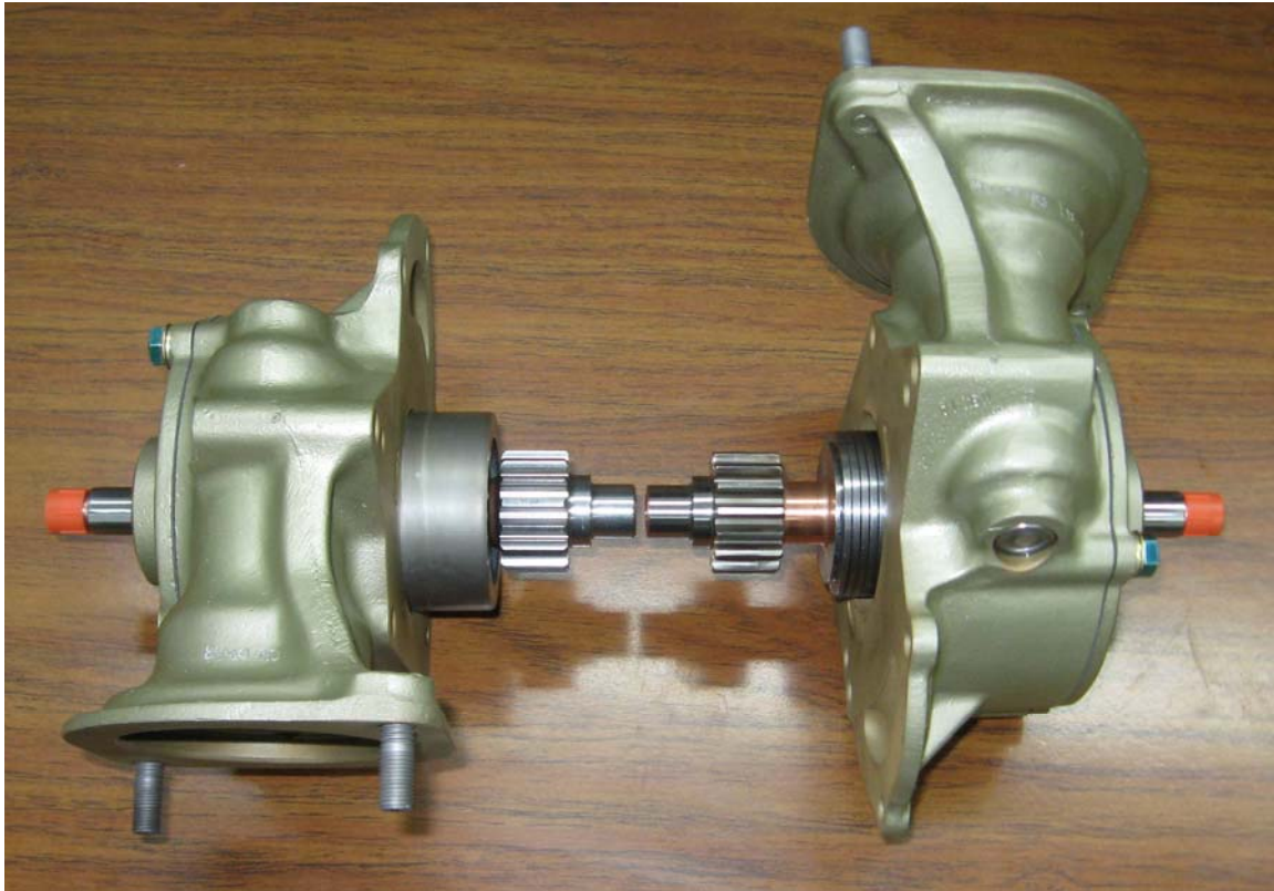
Classic "Original Style" Starter Adapter p/n 635050-Axx